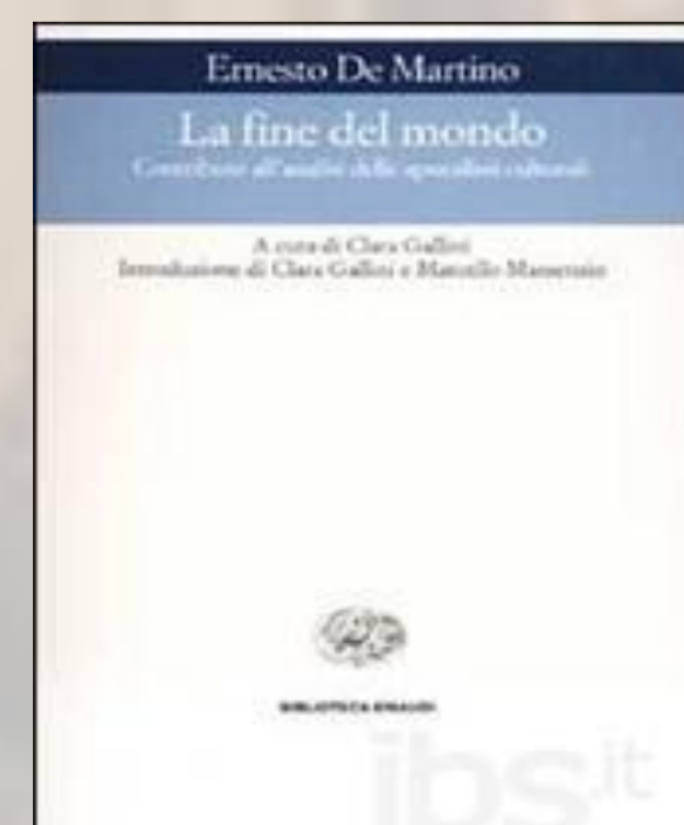
Fig. 2. The book cover of de Martino, La fine del mondo. Contributo alle analisi delle apocalissi culturali (1977)