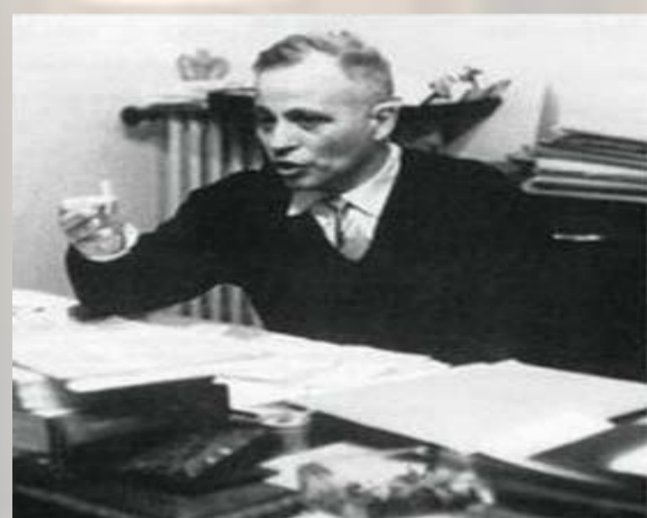
Fig. 1. The Italian philosopher Ernesto de Martino

The Italian philosopher identifies in repetition the characteristic behaviour of so-called primitives faced with the risk of not being-there – i.e. the risk of the end of the world and of man. Repetition of what? Of certain critical episodes (the first catastrophe, the first hunt, the first fishing, the first giving birth) or of certain critical passages, such as that from chaos to cosmos. This series of acts or episodes have the value of archetypes, of models, exemplary acts – not necessarily linked with religion – that are repeated for survival in light of their perceived protective function. This enables a series of mechanisms of defense of presence at critical moments.