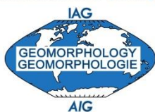
Association Internationale des Géomorphologues

IAPG - International Association for Promoting Geoethics and IAG - International Association of Geomorphologists signed a MoU - Memorandum of Understanding on 10 April 2019, in Vienna, during the EGU General Assembly 2019.