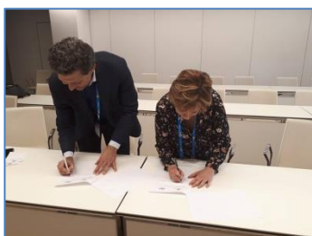
International Association of Geomorphologists